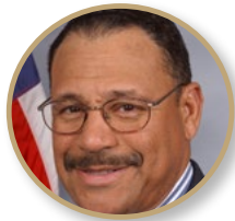
Sanford D. Bishop District 2 48.3%