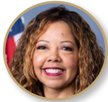
Lucy McBath District 6 66.3%